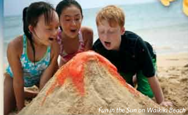
Fun in the Sun on Waikiki Beach