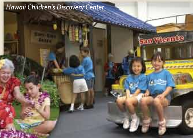
Learn about Hawaii's culture.