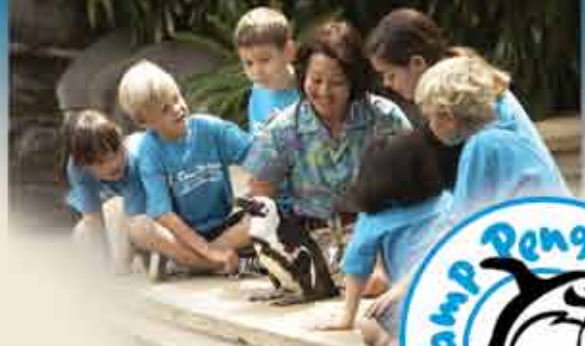
Hilton Penguin Pond is just one of our wildlife treasures.